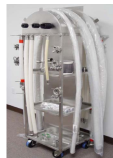
Figure 3. Proper hose storage.